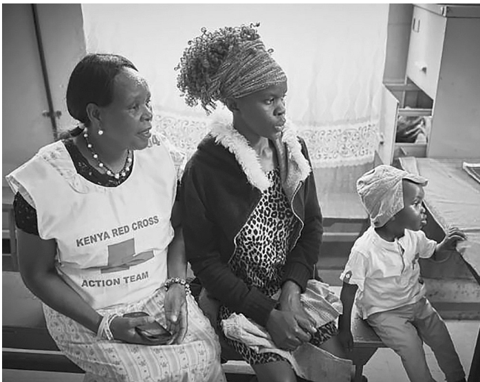
More than 4 million Kenyan children vaccinated in areas supported by the American Red Cross

Measles is one of the most contagious and severe childhood diseases. Every day, it takes the lives of hundreds of children around the world. Even if a child survives, measles can cause permanent disabilities, such as blindness or brain damage. But there is hope. Since 2001, the American Red Cross and our partners in the Measles & Rubella Initiative have vaccinated more than 2 billion children around the globe.