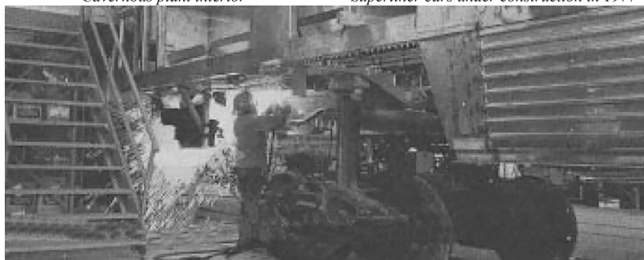
Welder working on Superliner trucks 1977