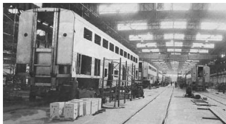
Superliner cars under construction in 1977