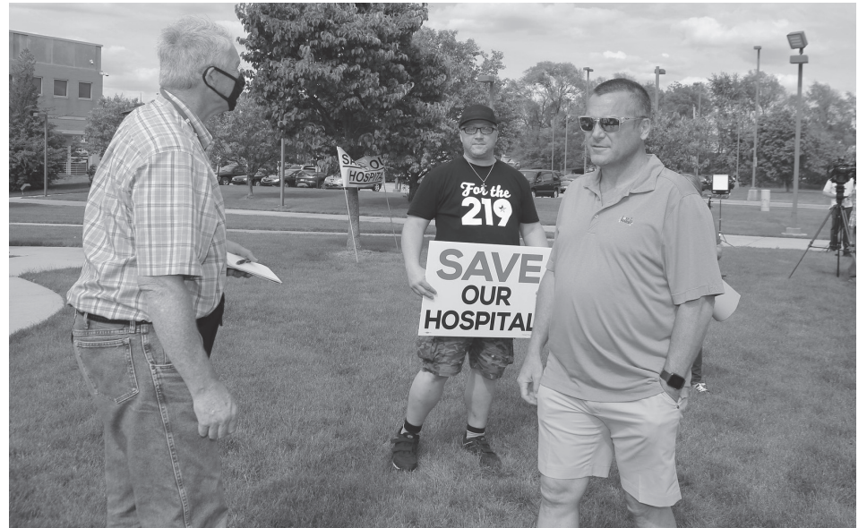
The city fought the closure, but ultimately Franciscan shuttered the hospital and demolished what was a long-standing city institution

The former hospital site kept one building standing on the northeast corner, which was transferred to Purdue Northwest and is being rehabilitated into the Roberts Impact Lab for Quantum Commercialization, slated to open in 2026. The parking garage on site was also spared