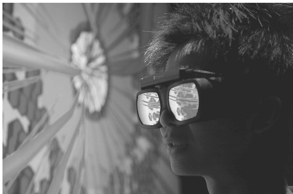
Purdue University Northwest (PNW), through its Center for Innovation through Visualization and Simulation, is a major partner from Indiana in an alliance awarded up to $1 billion in funding to develop a regional clean hydrogen production and distribution hub in the Midwest, as announced by President Biden on Oct. 13.