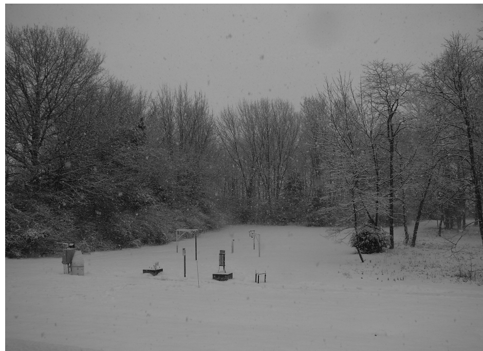
Snow at The National Weather Service (NWS) Indianapolis from the historic January 2014 snow storm.