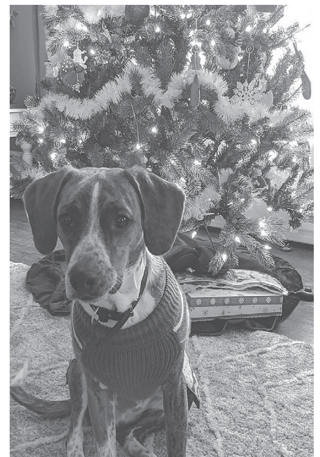
.Kosmic with his Christmas tree

To give Home for the Holidays, visit https://humaneindiana.org/givehope .