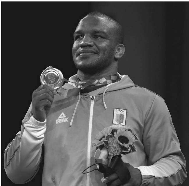
Gold medalist Zhan Beleniuk of Ukraine celebrates on the podium during the medal ceremony for men's 87-kilogram Greco-Roman wrestling. In 2019, he became the first black member of the Ukrainian Parliament.

From half way around the world, the Ukrainian National wrestling team is now training in Northwest Indiana at Hammond Central High School.