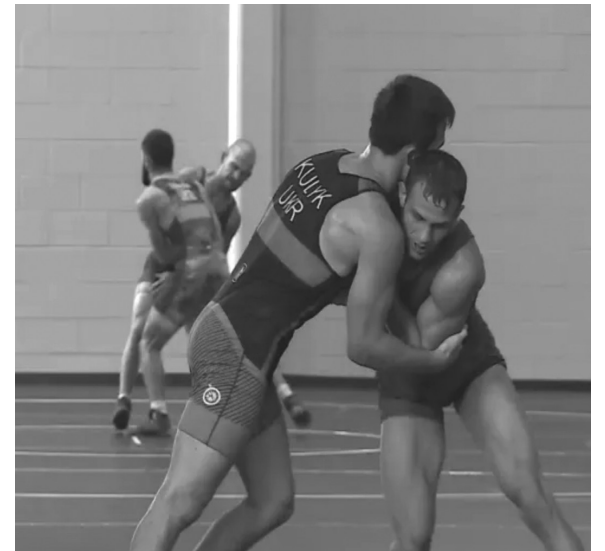
Ukraine's national Greco-Roman wrestling team now trains in northwest Indiana at Hammond Central High School

"My sister's husband is military. I am the same military and my sister's husband died