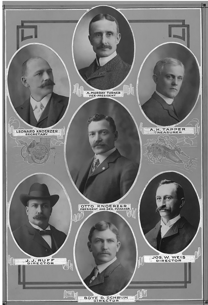
Hammond celebrities of the past

A little Hammond's history, for the young to learn and the old to remember