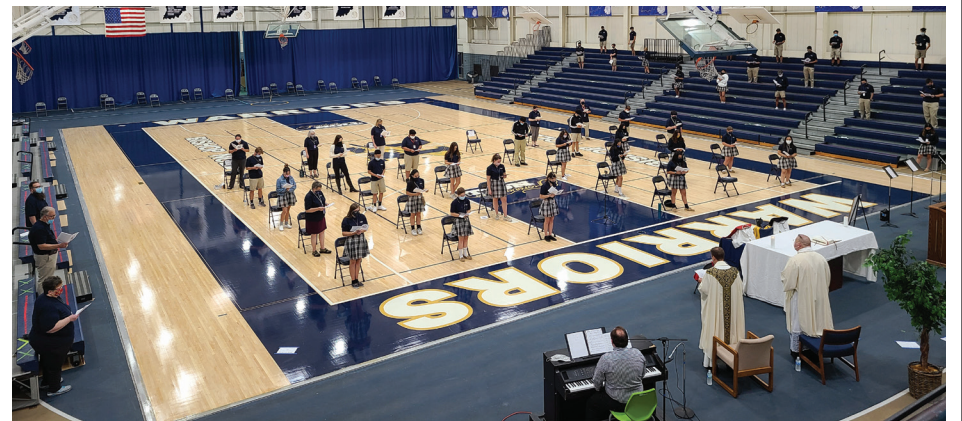
Bishop Noll seniors attend a special Mass to celebrate Founders' Day in September. While seniors attended Mass in the fieldhouse, other students watched a livestream and participated in their classrooms. The Catholic high school in Hammond has been celebrating its 100th school year while executing its re-entry plan.

had to be changed," she said. "We wore our masks and tried to distance ourselves as much as possible."