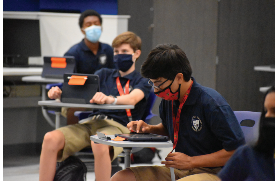
Bishop Noll Institute's students work on their iPads during Introduction to Engineering Design in the school's new STREAM Lab. Families had the choice between in-person and virtual education options.

"Golf is already the ultimate social distancing sport, so not much