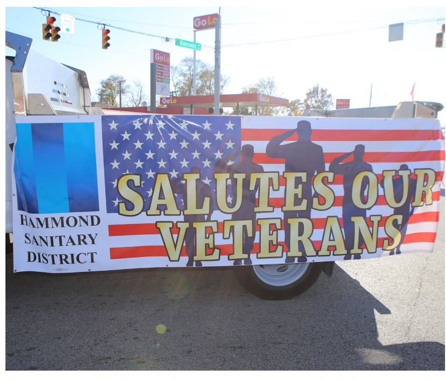
Hammond Sanitary District Salutes our Vetarans