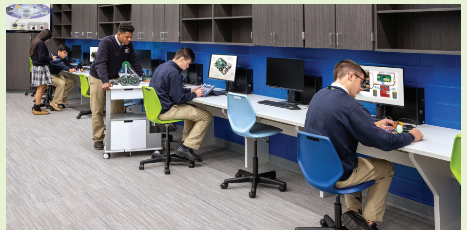
Bishop Noll students taking courses in the school's STREAM Lab have access to multiple 3D printers and 30 computers with AutoCAD engineering software.

Citation of Excellence awards, and four Honorable Mention awards.