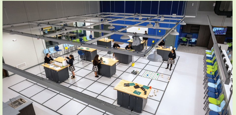
The Bishop Noll STREAM Lab, designed by the Wightman architecture firm, received an Award of Excellence from Learning by Design magazine, selected from more than 55 projects from around the country. The lab includes a learning studio and design lab, with flexible seating allowing students to work collaboratively; a makerspace for more hands-on work and creating prototypes based on original designs; and a prototype studio to build models and use larger equipment to build final products for display.

Twelve well-designed spaces were bestowed top awards. Four projects were awarded Grand Prize awards, four were designated with