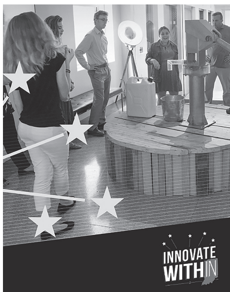
Purdue University Northwest and the Society of Innovators at PNW have partnered with Innovate WithIN, the most elite pitch competition in the country.