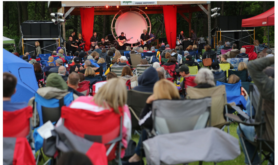
The Acorn Concert Series at Gabis Arboretum

The concert series is a fundraiser for the arboretum.