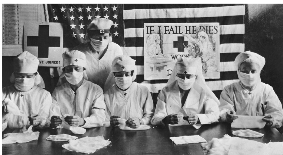
During WWI, American Red Cross workers made large quantities of warm garments and medical supplies for service members. Shown here are a group of workers making face masks during the 1918 influenza epidemic.