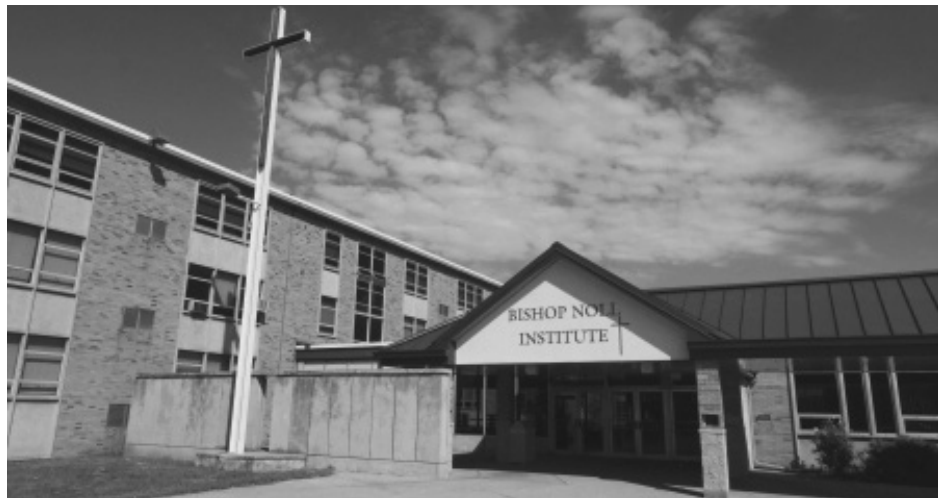
Bishop Noll Institute will host an entrance exam for prospective students January 23 at the school, 1519 Hoffman St. in Hammond.

HAMMOND Bishop Noll Institute will host an entrance exam for prospective students at 8 a.m. Jan. 23 at the school, 1519 Hoffman St. in Hammond. This is the first step in the admissions process for all 8th graders who have not taken the entrance exam yet and are interested in attending Bishop Noll.