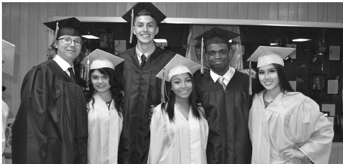
Bishop Noll Institute is currently enrolling students for fall 2021. Now in its 100th school year, Bishop Noll consistently receives high rankings from the Indiana Department of Education, including the highest graduation rate (99%) of any high school in Lake County over the past six years. In addition, Noll's Class of 2020 received $8.7 million in college scholarship offers.