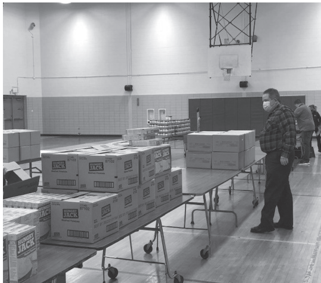
Volunteers from Strack & Van Til, MolsonCoors, Aunt Millie's and Indiana Beverage assemble Christmas dinner giveaways at John Will Anderson Boys & Girls Club in Gary.