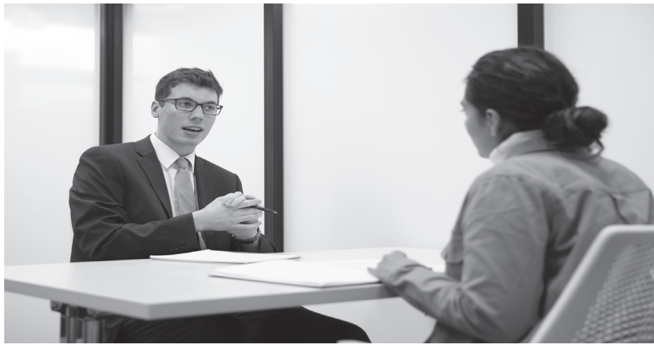
The White Lodging Professional Selling Lab at Purdue University Northwest is a high-tech sales lab where students develop confidence and hands-on skills in the sales minor program.

Purdue University Northwest (PNW) has been accepted as an associate member of the University Sales Center Alliance (USCA), one of only 62 universities in the United States and Europe to be part of the organization.