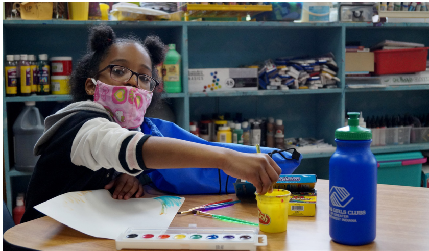
A Valparaiso Boys & Girls Club member wears a facemask while painting. All staff members are required to wear masks throughout the day, while youth are encouraged but not required to do so.

After Boys & Girls Clubs of Greater Northwest Indiana made the decision to close its doors on March 13 in response to the COVID-19 pandemic, Clubs across Porter and Lake counties sat empty. Like nonprofits across the country, the organization was faced with the challenge of maintaining viability and continuing to serve the community in ways that stayed true to its mission. For weeks, leadership debated the crucial next steps that would define the organization's response to the pandemic.