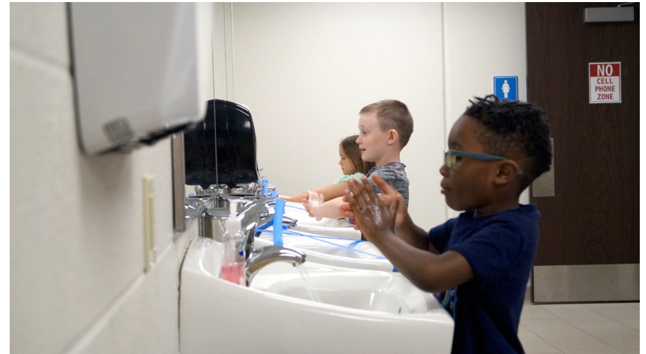
Members of Duneland Boys & Girls Club wash their hands between program sessions.